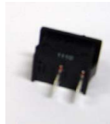
CSWITCH100—ROCKER SWITCH ON/OFF LIGHT ON ECONOMY MODELS.