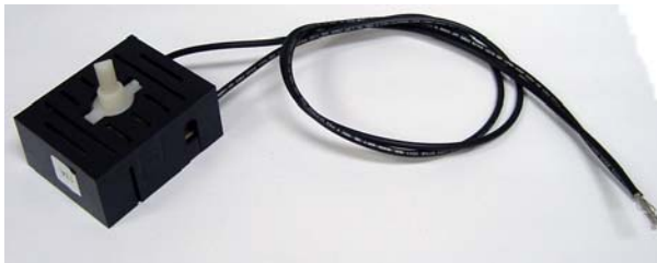
CSWITCH150—3 AMP MOTOR SWITCH, REOSTAT. MODELS: BP1 / SD4 / PS1