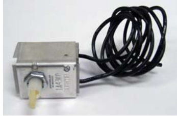
CSWITCH155—REOSTAT LIGHT SWITCH—2 LIGHT- BULBS—3000SD4/3000PS1