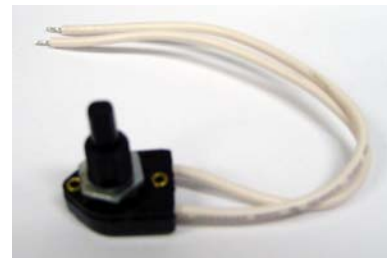
CSWITCH120—LIGHT AUTO SWITCH FOR 3000/G3000 DRAWER MODELS.