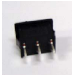
CSWITCH115—ROCKER SWITCH TWO POSITION MOTOR & LIGHT ON SD2 MODELS. MOTOR ONLY ECONOMY