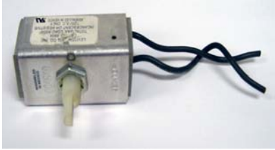
CSWITCH140—REOSTAT LIGHT SWITCH—4 LIGHT BULBS