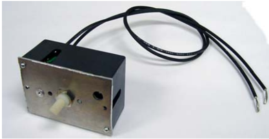
CSWITCH170—5 AMP MOTOR SWITCH, REOSTAT. (Prior to 2016)