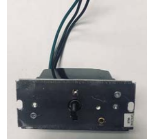
CSWITCH160—REOSTAT LIGHT SWITCH—2 LIGHT BULBS.